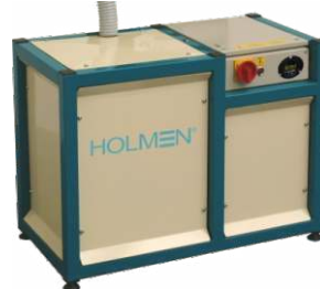
In-line / Automatic Feed & Wood Pellets