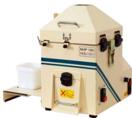
Portable / Manual Feed Pellets