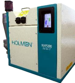
Desktop / Automatic Feed & Wood Pellets