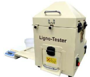
Portable / Manual Wood Pellets